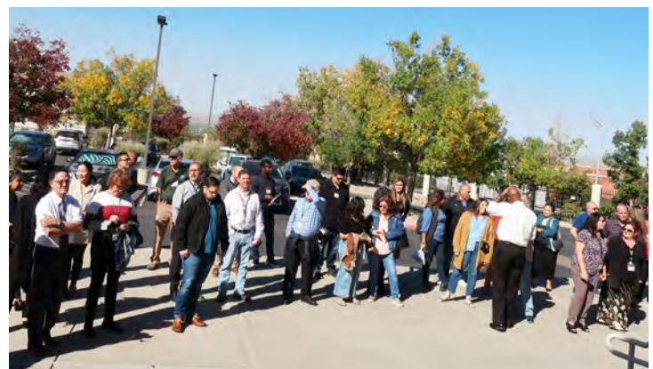
WCA staff gather in front of the agency in Albuquerque

This year, there was also a mural unveiling ceremony to honor long-time employees and those who passed away while employed with the WCA. There was a mini-reunion of many former staff who were invited back to see their names on the mural.